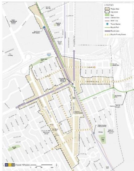
Figure 7.16: Recommended Bicycle Facility Improvements

← ○ Caltrain San Bruno Station ⋮ ⋮ 📍 Millbrae ↕